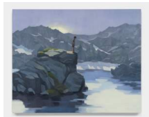
Yuri Yuan Echo , 2024 Oil on Linen 48 x 60 in. 121.92 x 152.40 cm YY.24.03