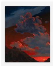
Yuri Yuan September , 2024 Oil on Linen 60 x 48 in. 152.40 x 121.92 cm YY.24.05