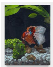
Yuri Yuan Michael Wants His Privacy , 2024 Oil on canvas 40 x 30 in. 101.60 x 76.20 cm YY.24.02