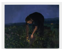
Yuri Yuan In the Field , 2024 Oil on Linen 48 x 60 in. 121.92 x 152.40 cm YY.24.06