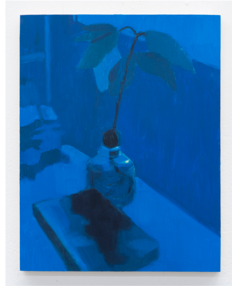
Avocado (Blue Series), 2021