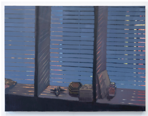
City of Trauma, 2021