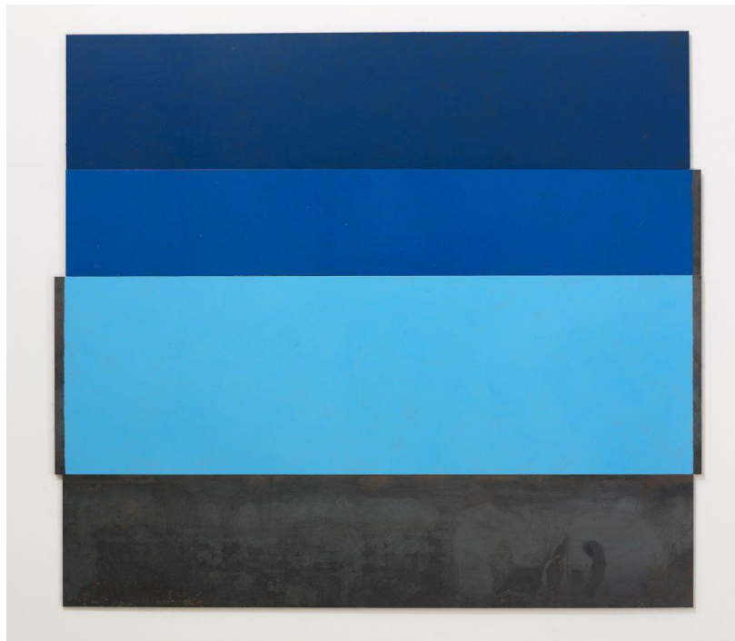
Merrill Wagner, Inlet (2010).

“52 Artists” will highlight the collective cultural impact of both artists and the show as a whole, illustrating their impact on the current generation of women and nonbinary artists.