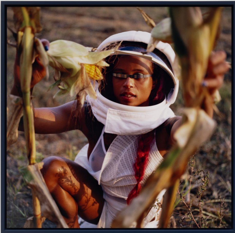
Tourmaline, Violet Copper (2020–21).

Lucy Lippard's landmark 1971 exhibition was one of the first to acknowledge the institutional invisibility of women artists. Sarah Cascone , October 13, 2021