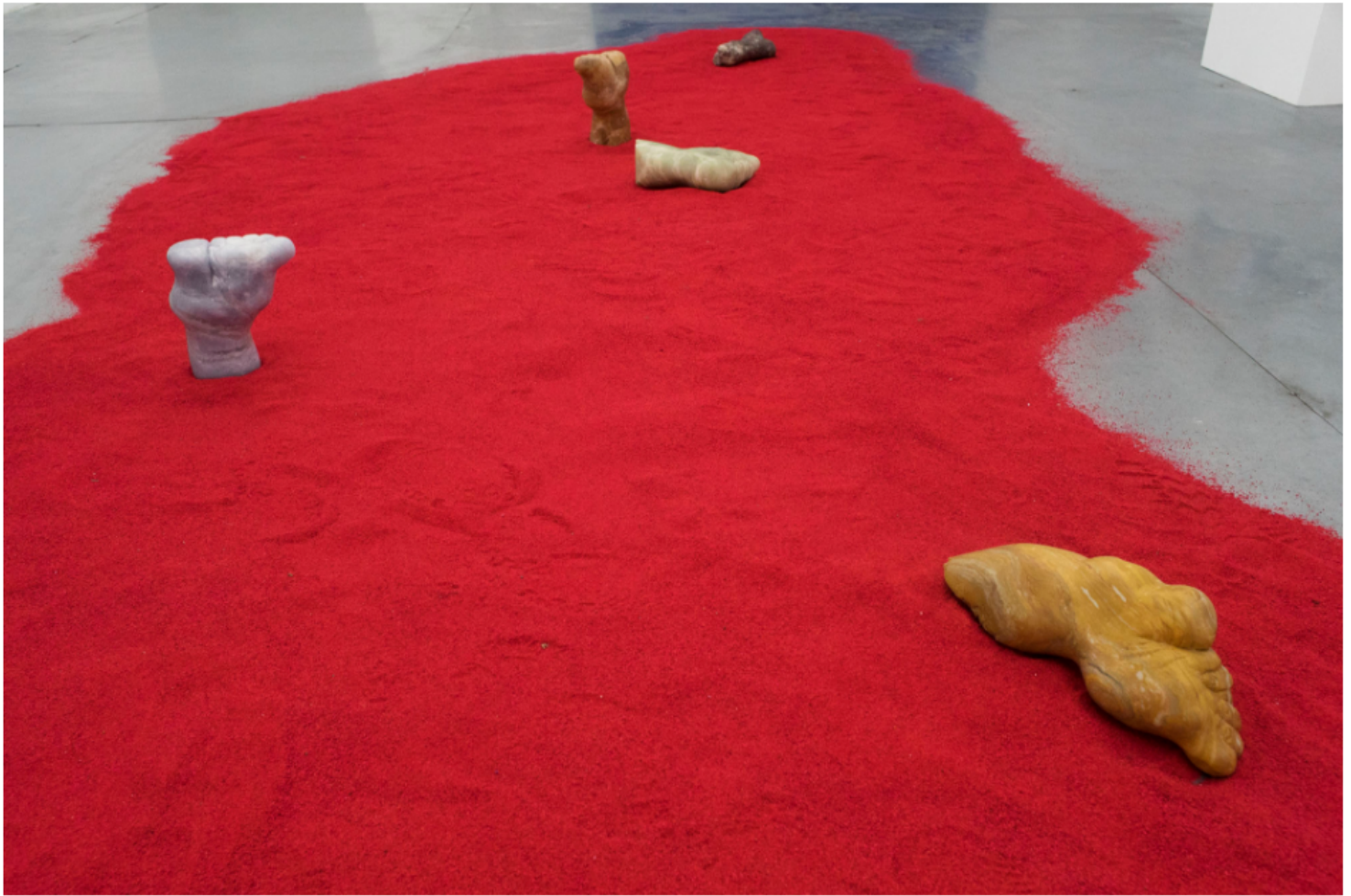
Catalina Ouyang, Terrarium, 2018, red sand, imagined lotus feet of the artist's great-grandmother carved out of alabaster, soapstone and wonderstone, image courtesy of Rubber Factory

“No one is unique. Everything i live has been lived before. I think this is important and beautiful.”