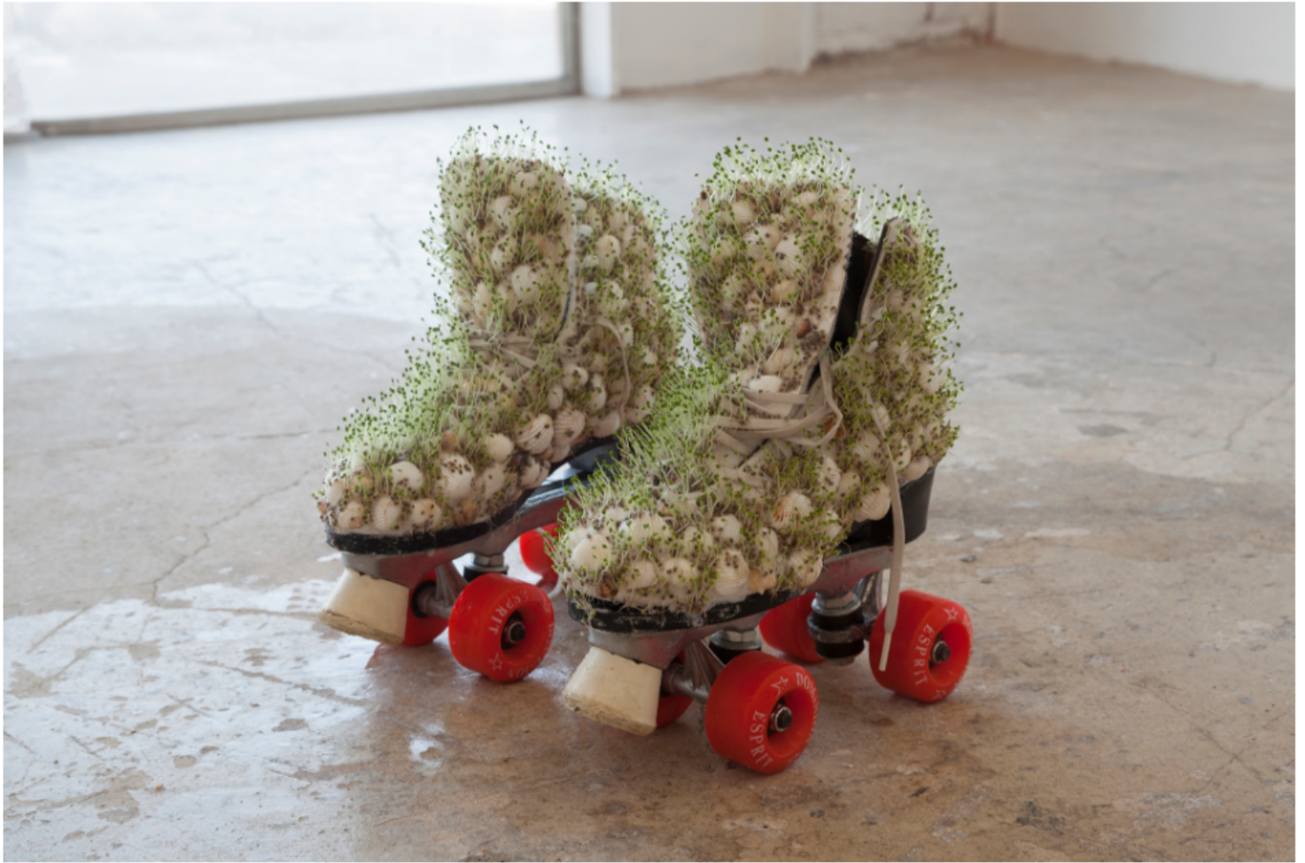
Catalina Ouyang, chia skates, 2018, roller skates, chia plants, image courtesy of Make Room LA