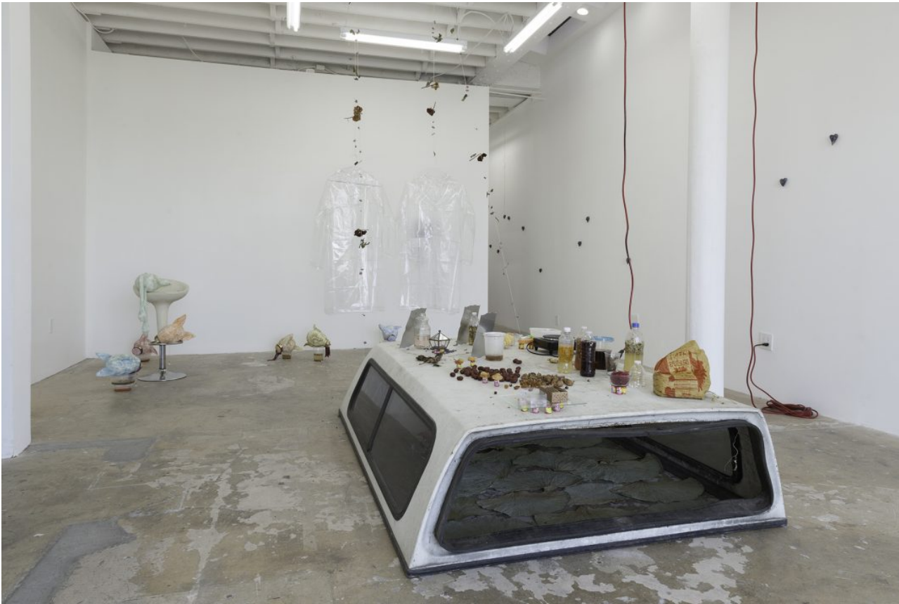
DEATH DRIVE JOY RIDE, 2018