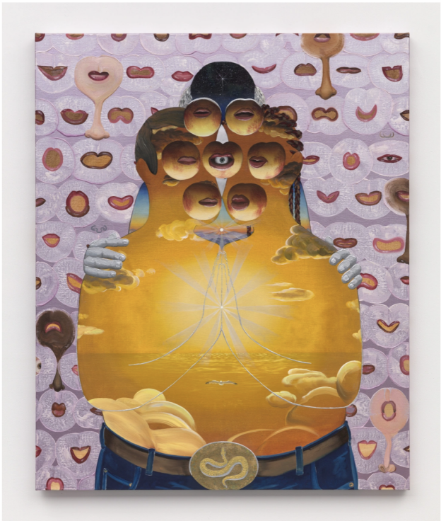
Miguel Angel Payano Jr., “Good Union a k a The Cyclops,” 2021. Acrylic, oil faux gold foil, mirrored plastic and glitter on linen and aluminum stretcher

Two large sculptures by Patricia Ayres dominate the main room with an impressive display of bodily abjection. These lumpy piles of stained fabric deliver a frisson of disgust that nails the vibe of asymmetric bias.