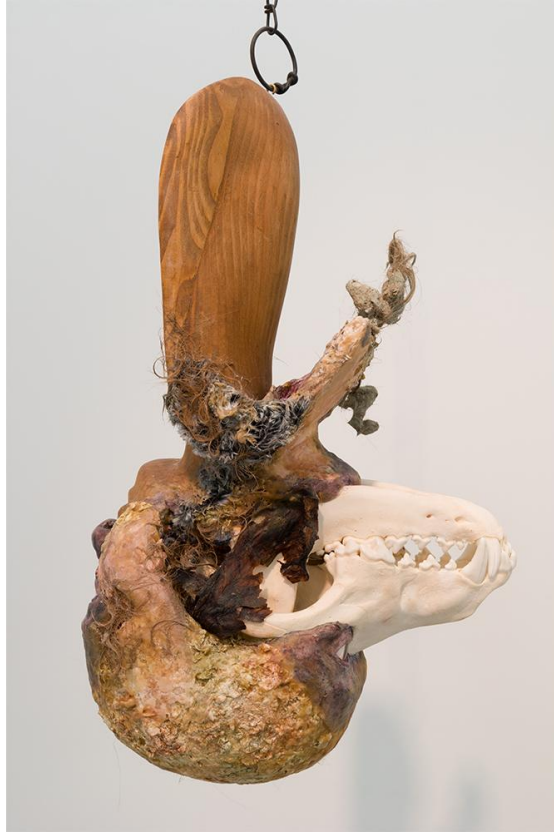
Catalina Ouyang, reliquary janus , 2021. Carved wood, gray wolf skull, plaster, horse hair, polymer clay, epoxy clay, acrylic, deconstructed stop loss trap. 91.4 × 30.5 × 15.2 cm.