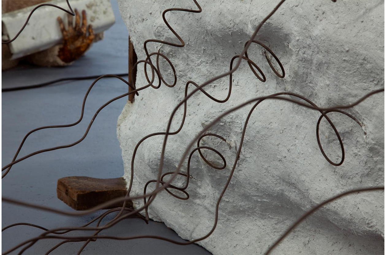
Catalina Ouyang, bitch bench, 2018. Detail. Steel, polystyrene, plaster, Celluclay, wood, acrylic, and epoxy resin. 289,56 x 576,58 x 93,98 cm.