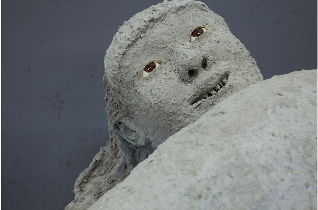
Catalina Ouyang, bitch bench, 2018. Detail. Steel, polystyrene, plaster, Celluclay, wood, acrylic, and epoxy resin. 289,56 x 576,58 x 93,98 cm.