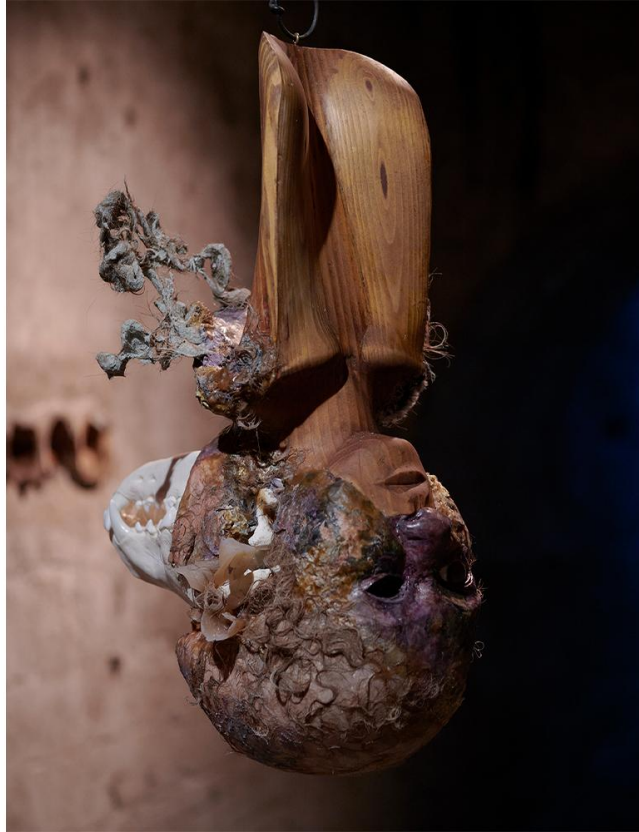
Catalina Ouyang, reliquary janus, 2021. Carved wood, gray wolf skull, plaster, horse hair, polymer clay, epoxy clay, acrylic, deconstructed stop loss trap. 91.4 × 30.5 × 15.2 cm.

Like so much of Ouyang's work, the variety of materials and references employed in common burn allude to psychosexual and generational traumas that are not meant to be resolved but rather give rise to contingencies of being outside logic and morals. The artist's relationship to language is much the same. Go to their website: you'll find a string of thoughts and quotes sutured together and a bloody knife that acts as your cursor. Reflective of a promiscuous, deeply intuitive reader, these excerpts suggest the affective nature of language, what the artist deems its "energy and patina" that over time can "rub off on object making."