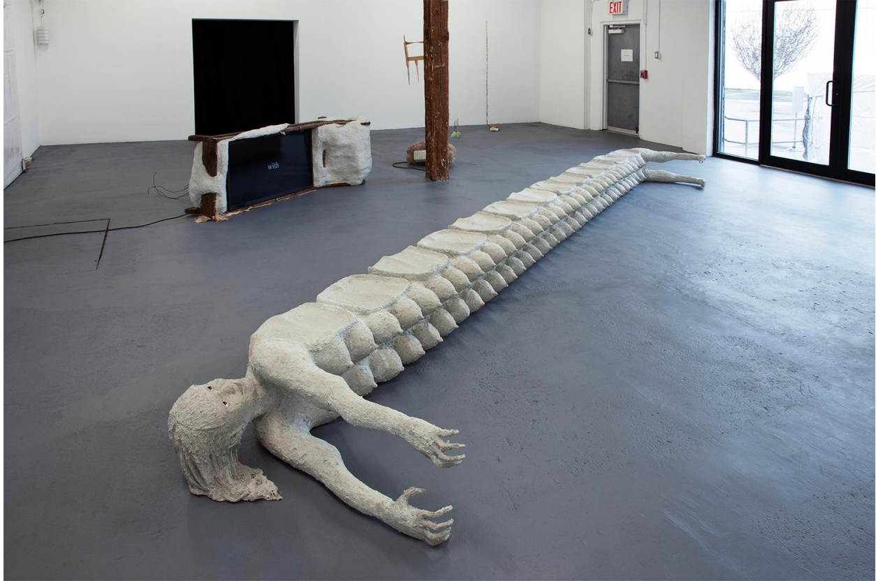
Catalina Ouyang, bitch bench, 2018. Steel, polystyrene, plaster, Celluclay, wood, acrylic, and epoxy resin. 289,56 x 576,58 x 93,98 cm.